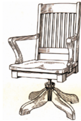
DESSINS : BILLNÄS BRUKS AKTIEBOLAG.

In Finland, Billnäs Bruk Aktiebolag started manufacturing American style office furniture in 1909. A significant part of this product line was the Globe Wernicke bookcase design. Billnäs Bruk merged with Oy Fiskars Ab on the 1st of January 1959, but continued to manufacture furniture under the name Billnäs Bruk. The making of American style office furniture ended in the late '60s and the furniture factory was closed down in 1970.