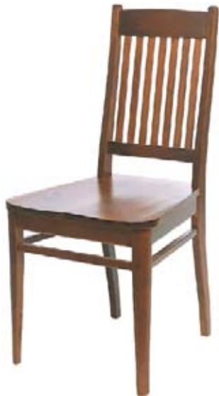
Side chair birch, contoured seat. seat height 45 cm, overall height 93,5 cm.

For the chair you may choose dining chair or side chair.