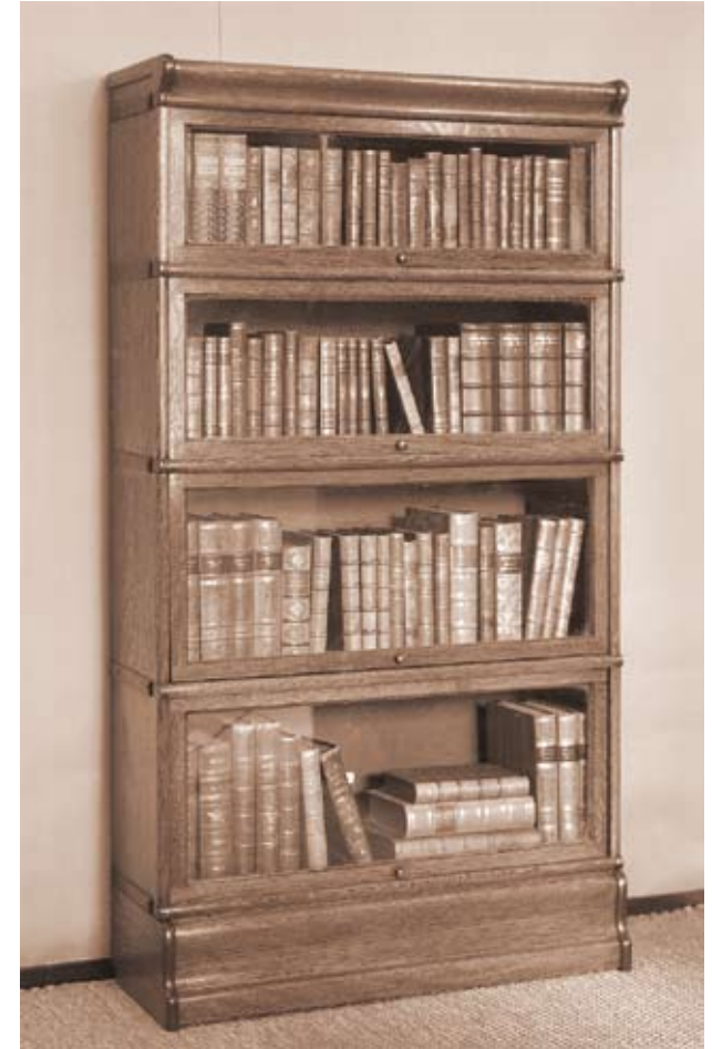
THE GLOBE WERNICKE Co, Cincinnati USA.

In Finland, Billnäs Bruk Aktiebolag started manufacturing American style office furniture in 1909. A significant part of this product line was the Globe Wernicke bookcase design. Billnäs Bruk merged with Oy Fiskars Ab on the 1st of January 1959, but continued to manufacture furniture under the name Billnäs Bruk. The making of American style office furniture ended in the late '60s and the furniture factory was closed down in 1970.