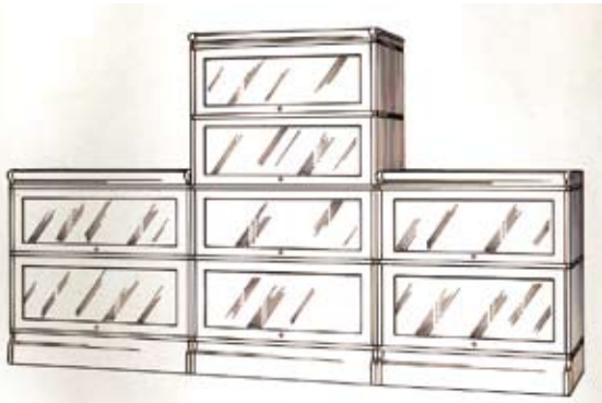
DESSINS : BILLNÄS BRUKS AKTIEBOLAG.

An American businessman Henry C. Yeiser set up a furniture factory called The Globe Files Co in Cincinnati in 1882. The factory started manufacturing office and filing furniture. In about the same time, a furniture factory called The Wernicke Co was set up in Grand Rapids, Michigan. A few years later The Wernicke Co designed a bookcase, which consisted of different sized glass cabinet components.