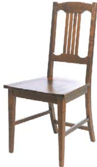
Dining chair birch, contoured seat. seat height 46 cm, overall height 97,5 cm.